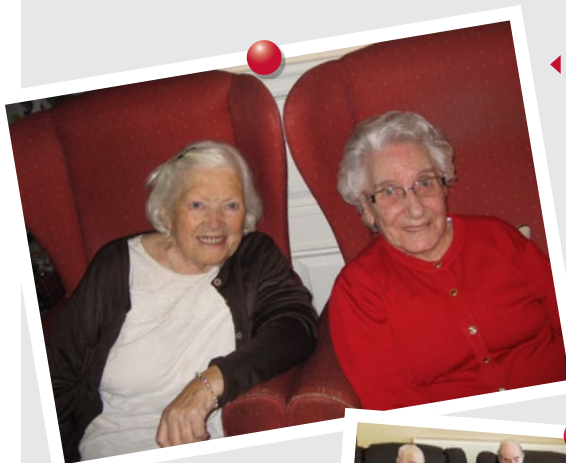
◀ Two smiling residents at Alexander House