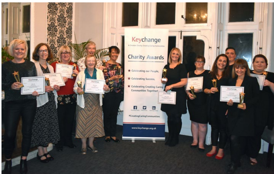
The first Keychange Charity Awards winners (or representatives from their communities where not present) lined up after receiving their trophies, certificates and cards