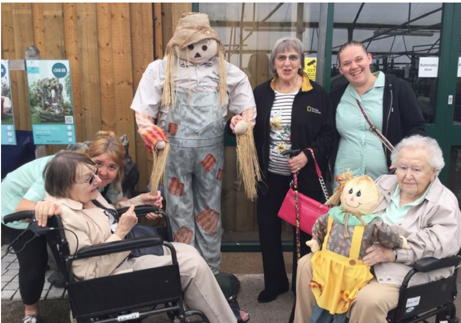
The Oomph! bus took residents from Erith House in Torquay to a local garden centre called Jack's Patch where they enjoyed looking around and making new friends!