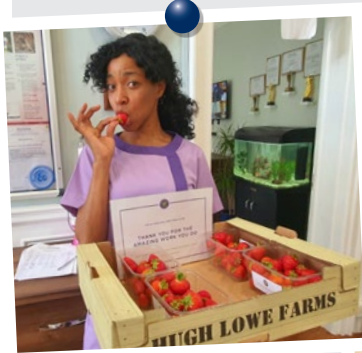
Wimbledon Tennis sent Alexander House some strawberries to thank them for their hard work during the pandemic