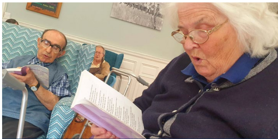
People living at Alexander House singing hymns during a Praise, Prayer and Togetherness service