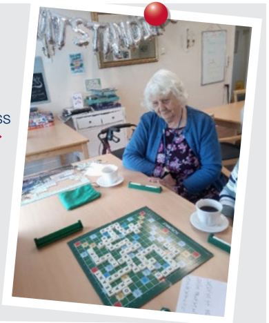
Scrabble and jigsaw in progress at Rose Lawn