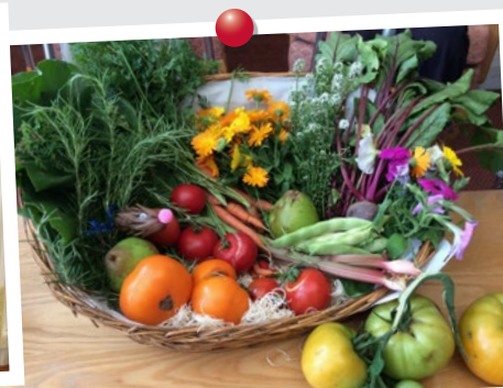
A socially-distanced visit in the garden at Cressingham House