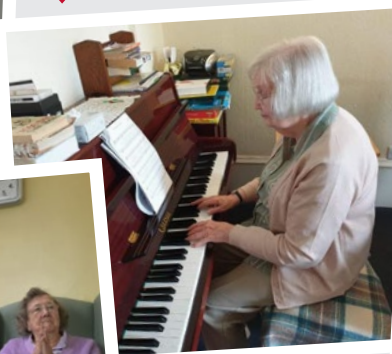
Listening to a special courtyard singer at Romans