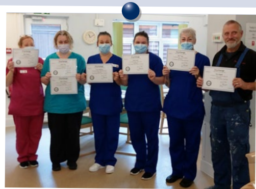
The winners at Fair Havens line up with their certificates