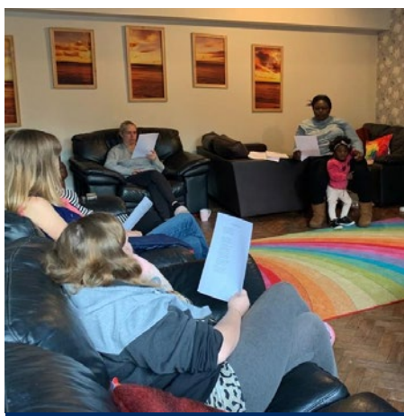
Wayside Community hosted one of the Praise, Prayer and Togetherness sessions