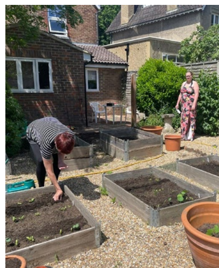
The good life: The garden at Wayside

In time to come, residents will be shown how to incorporate the vegetables in cooked dishes and preserves. ■