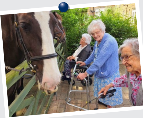
▲ People living at Alexander House meeting some of their neighbours from Wimbledon Village Stables